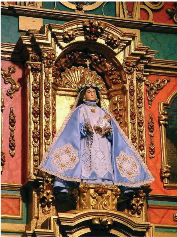
Basilica of St. Francis of Assisi in Santa Fe, New Mexico.

Monastery of Our Lady of the Desert PO Box 556, Blanco, NM 87412-0556 Telephone: 505-419-2938 www.ourladyofthedesert.org 2025