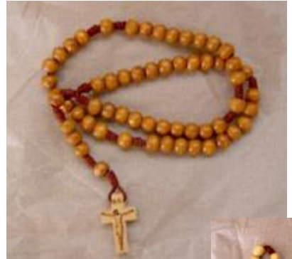
Brown wood beaded Rosary $12 ITEM BR