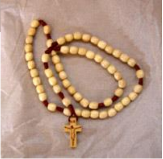
Cream wooded bead Rosary $12 ITEM CR