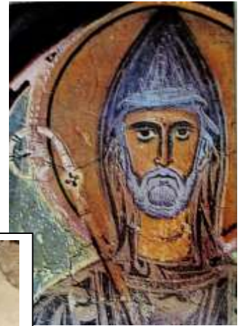
This portrait of St. Benedict was in our classroom.

A special thank you to my family and friends that made this possible!