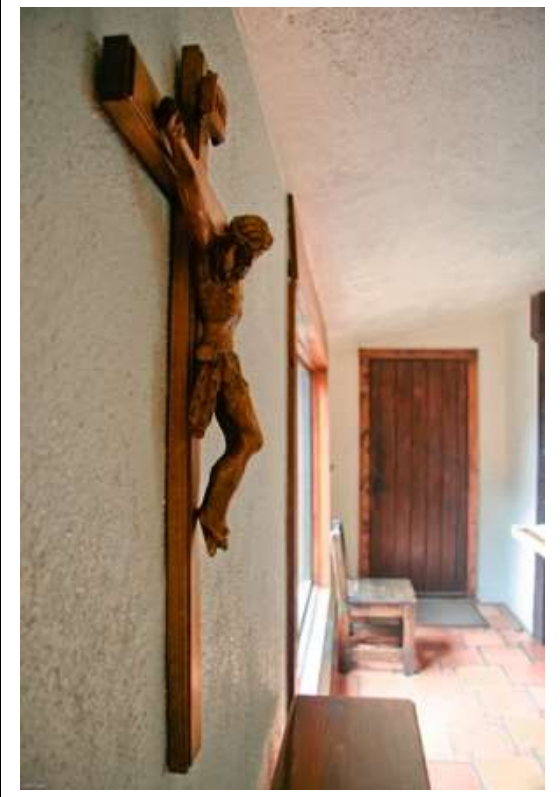
Crucifix in our Chapel.