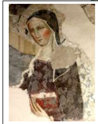
Fresco of St. Scholastica in a church near Nursia