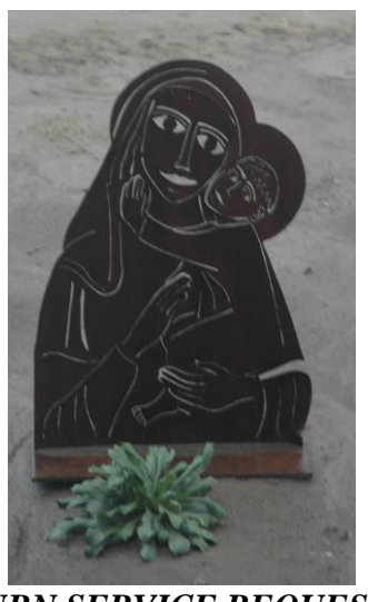
RETURN SERVICE REQUESTED

NON-PROFIT ORG. U.S. POSTGE PAID ALBUQUERQUE, NM PERMIT NO. 1888