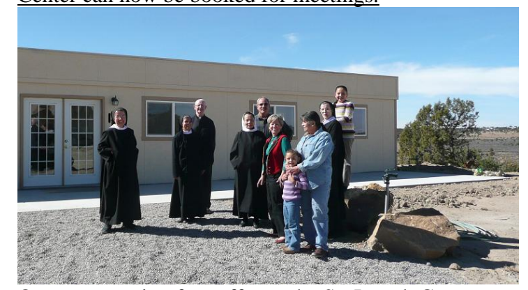
Our guests going for coffee at the St. Joseph Center after Mass on Sunday.

Besides the Guesthouse, we were also happy to set up the St. Joseph Center, a gift from the Abbey of St. Walburga, Virginia Dale, CO. The outside of the building was repainted, and cement was poured for the patio , and five large windows added. The kitchen area has been remodeled and conference tables and chairs are in place. The St. Joseph Center can now be booked for meetings.