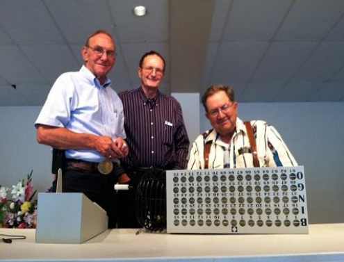
Hats off to the Knights of Columbus who helped us with the Bingo at our 3<sup>rd</sup> fun-filled Ice Cream Social in June.